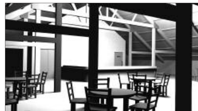
The café facility within Warehouse 5.

Our Conservation Plan has been re-edited and designed by Don Allan of Graphic Sequence for publication on a DVD and will be available for purchase in the early summer.