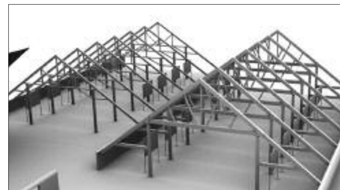
Exhibition spaces below the roofs of Warehouses 3 and 4.