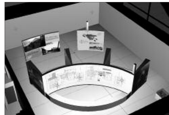
Reception desk with graphic panels behind.