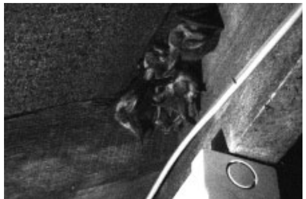
Six long eared brown bats photographed in our loft. We hope to arrange a bat walk on site in August 2009 so you can see and hear our own bats flying around the grounds.

A half hour programme on BBC Radio 4 was Broadcast on Wednesday, 5 November, 2008. Thought it concentrated on rock salt mining, Presenter Allan Beswick Visited the Lion Salt Works and Ashton's Flash to uncover information about early mines and open pan salt making.