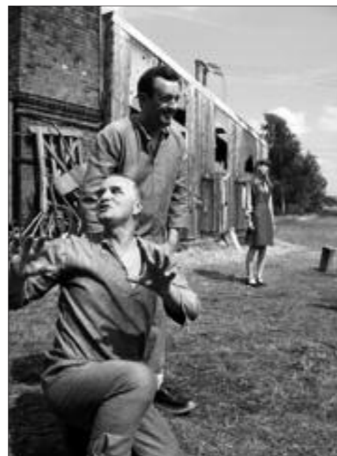
Salt workers demonstrate how salt blocks were lofted.