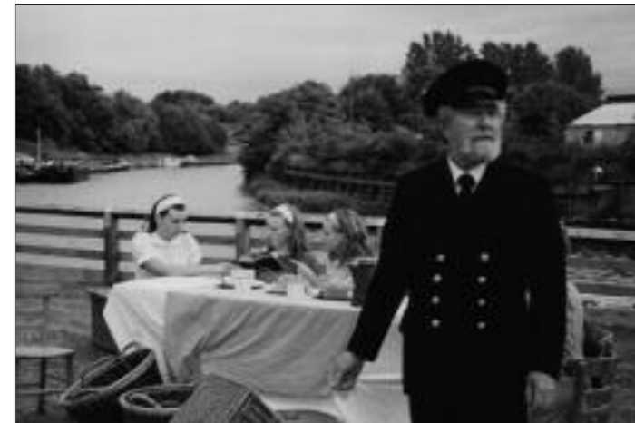
The Lock Keeper's Story.