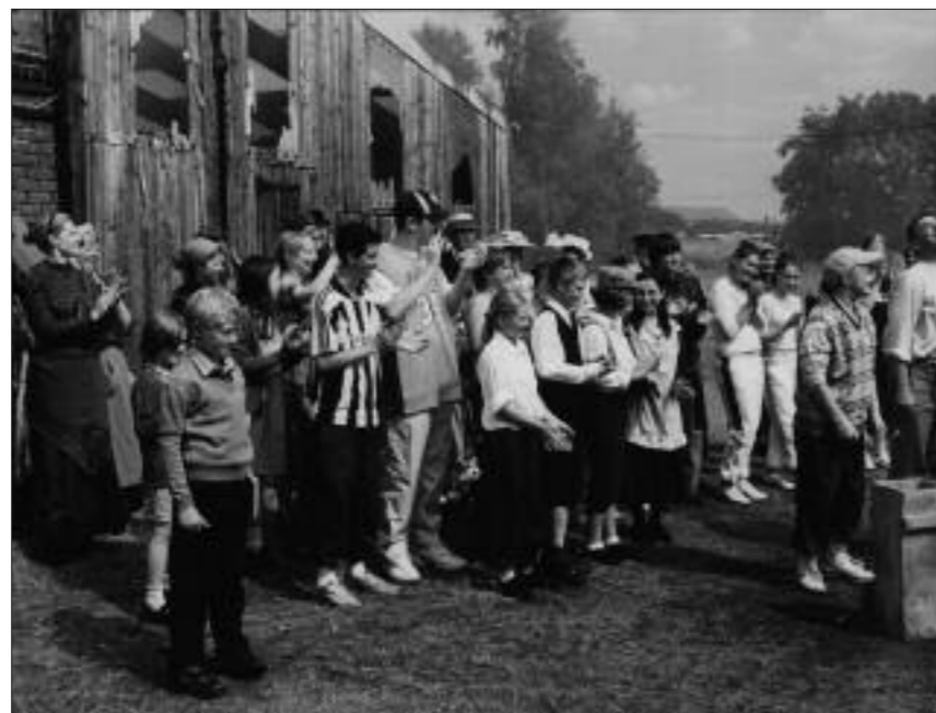
Curtain call at 'The Works'

The Thursday evening performance took place on the day of the London bombings. A one minute silence was held by cast and audience before the opening scene.