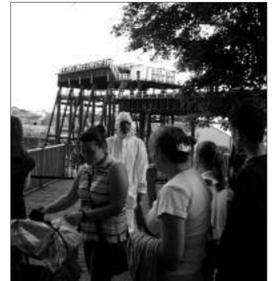
The 'Watercrats' introduce the audience to the site at the Anderton Boat Lift..

Never turn your back on what once was. Make it be again. Make me be again Pure and simple Nothing complicated Pretty as a picture Is our history.