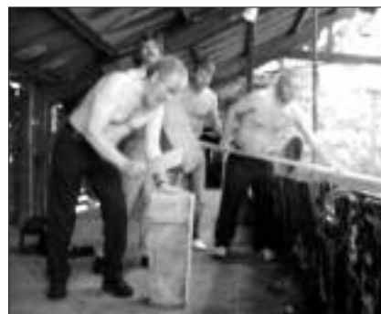
Replicating a scene from on open pan salt.