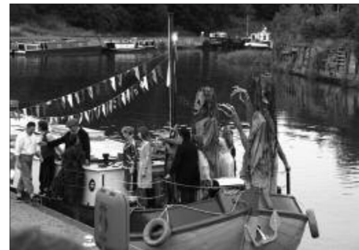
The "Works" and "River" are re-united at the end of the play and depart into the night by barge.