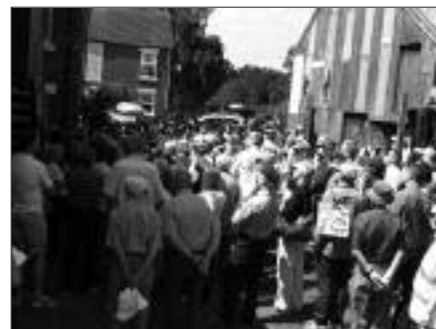
The audiences follows the cast around the Lion Salt Works and the Anderton Lift as each scene made use of a different area to tell a different story.